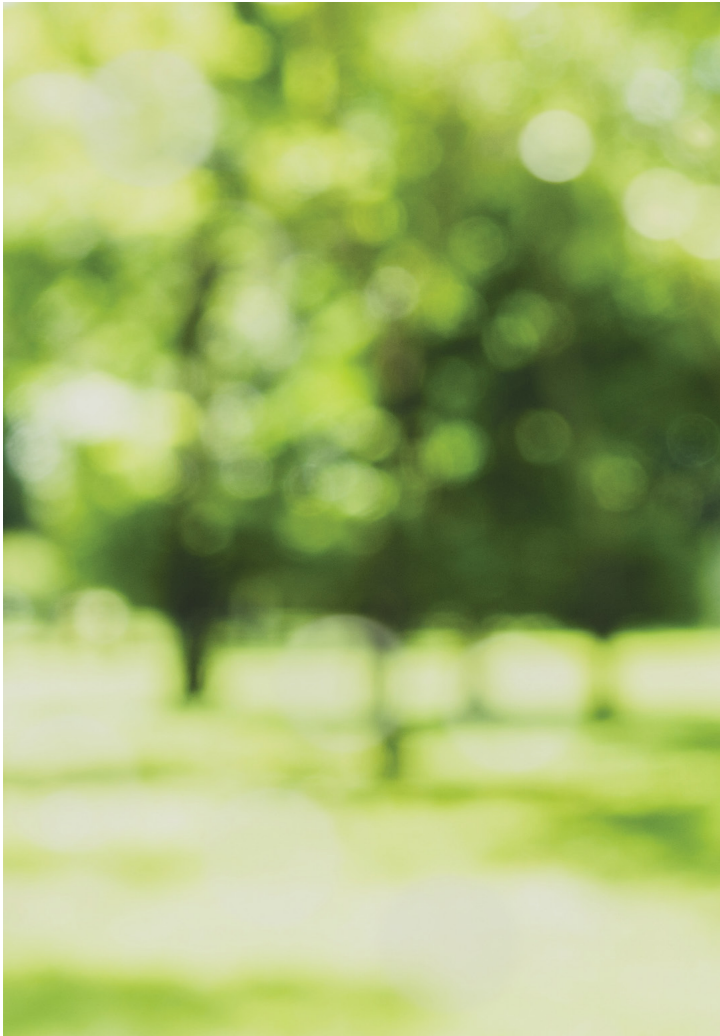
Images shown are artist impressions and shown for illustrative purposes only.